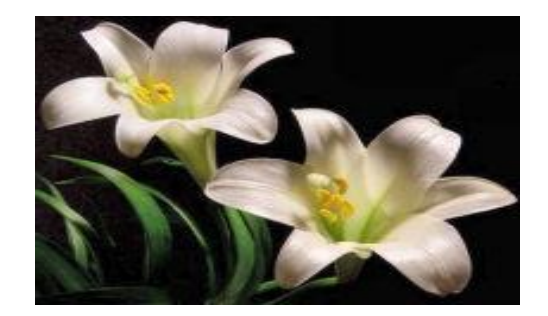
"We are an Easter people." ~ St. Augustine