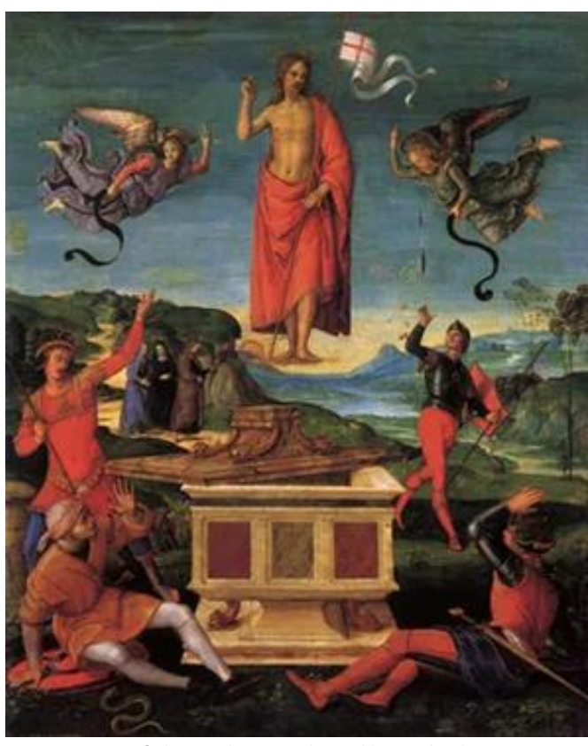
Resurrection of Christ, oil on wood panel by Raphael, 1499–1502