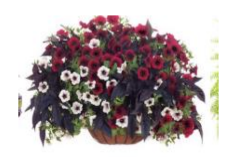
BSA Troop 900 2024 Spring Hanging Flower Basket Fundraiser