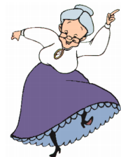
- Author Unknown

Praise the Lord for such wonderful folks! Love, Granny