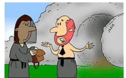
I'M SORRY MAAM, THE RESURRECTION OF JESUS WAS A MIRACLE, NOT A SERVICE OF THIS CEMETERY

He replied, just as frustrated, " I'm waiting for Jesus to come and help me clean my room! "