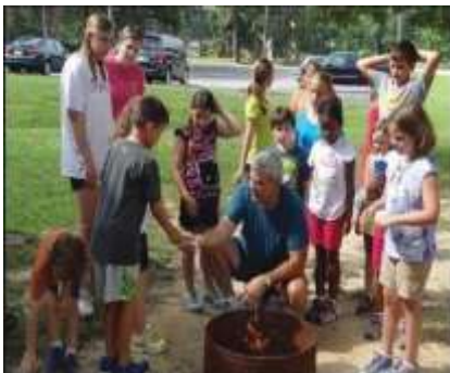
GMPC Day Campers develop outdoor living skills as they learn to safely build a fire and cook lunch over an open flame.