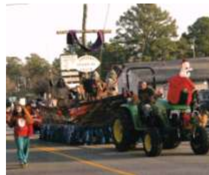
2012 GMPC Float "Fishers of Men"

location (Cliff Applewhite, Store Mgr.) for providing the needed horsepower for pulling this year's prize-winning float ----a Model 4520 John Deere Compact Utility Tractor.