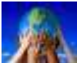
Generous Hearts © and Caring Hands to those in need”

Thank each of you who supported the Emergency Aid Fund with contributions.