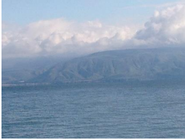
Looking at the mountains of The Golan Heights, on the Shores of the Sea of Galilee

Dear Saints and Friends of Gregory Memorial,