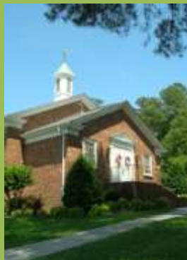
Gregory Memorial Presbyterian Church