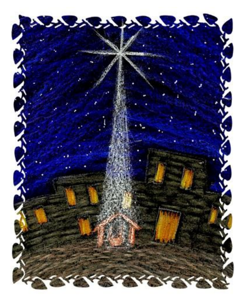
His life gave light to everyone... The light keeps shining in the dark, and darkness has never put it out. - John 1:3-5